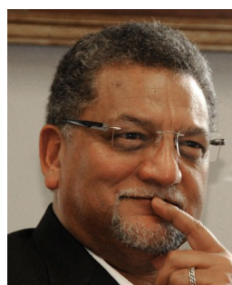
Ivan Abrahams, South African Bishop & leader of World Methodism, will keynote the Center's Spring Is A Time for Hope brunch April 13, 2013.