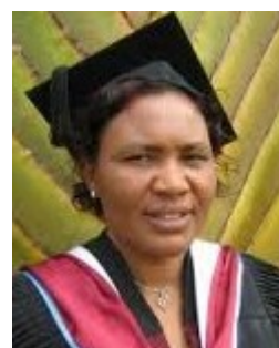
Bishop-elect Catherine Mutua, the first African woman episcopal leader of Kenya Methodism, will supervise the orphan program of the Center.