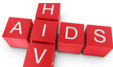
(Cross as Rwanda AIDS symbol)

now over 11% of the population are living with HIV and AIDS. The Philippines is cited by UNAIDS as one of seven countries where HIV is escalating rapidly. The numbers have doubled in recent years.