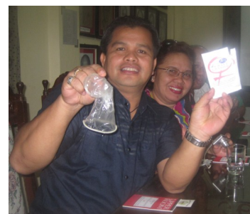
(Pastor & spouse display female condom)

About a million people were massacred in Rwanda’s genocide &